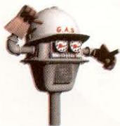
G.A.S. (Good And Safe)