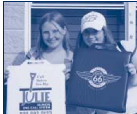
JULIE, Inc. sponsored several events this summer, including a demolition derby at Route 66 Raceway in Will County. The event attracted over 8,000 people and the response was extremely positive.