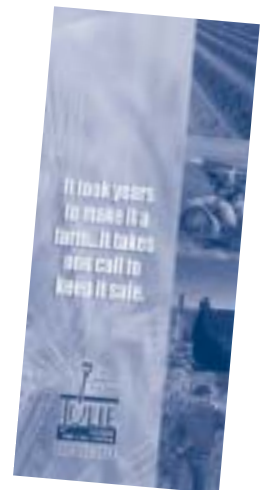
New Ag Brochure