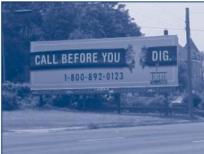
Does this billboard look familiar? This billboard was seen by commuters in the Quad Cities.

JULIE, Inc.'s statewide public safety campaign continues to reach target audiences during the fall dig season. In addition to on-camera and statewide radio interviews with JULIE staff, the media mix includes television and radio commercials, public service announcements and outdoor advertising.