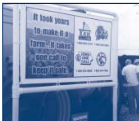
A banner outside the damage prevention tent reflected the safety theme.